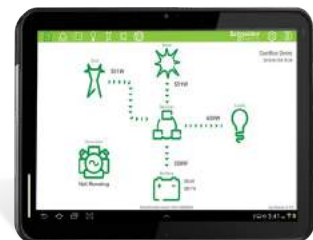
Conext ComBox Android tablet application